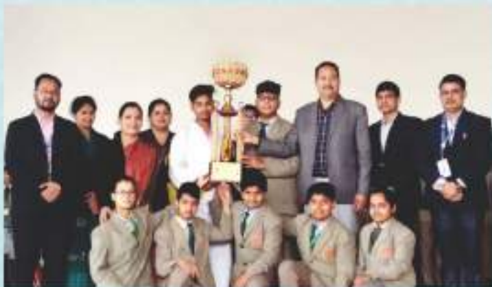
Overall Champion of "Chakarvyuh" Annual Sport Meet - RUBY HOUSE

It is a co-educational School, which is running in a huge, extremely beautiful and well furnished building with eco-friendly campus. In the year 2010, main branch at Murlipura, Jaipur with students strength of 3000, celebrated its silver jubilee. It has deep & abiding commitment to the cause of education and has been giving excellent results in secondary and Sr. Secondary board examinations.