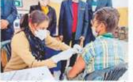
एनके पब्लिक स्कूल में स्वास्थ्य विभाग के वैक्सीन अभियान का आयोजन।

युवा पीढ़ी में कोविड-19 के बढ़ते हुए संकेतों के कारण 15 से 18 वर्ष के बच्चों के टीकाकरण अभियान में जोश मच चुका है। इसी क्रम में ईद मौक़ा रोड जयपुर स्थित एनके पब्लिक स्कूल में स्वास्थ्य विभाग, जयपुर सरकार के वैक्सीन अभियान के अंतर्गत 100 से अधिक बच्चों को टीकाकरण कराया गया।