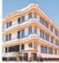
एन.के.पब्लिक स्कूल का नया भवन।