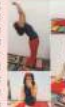
एनके पब्लिक स्कूल के विद्यार्थियों की योग प्रतियोगिता में भाग लेते हुए।

जयपुर बुधवार/इलाहाबाद। ईद मौक़ा रोड स्थित एनके पब्लिक स्कूल में 14 जून से 21 जून तक योग सप्ताह के रूप में आयोजित योग सप्ताह कार्यक्रमों का आयोजन किया गया। योग प्रतियोगिता आयोजित की गई। योग प्रतियोगिता 7:00 से 7:30 के बीच का कार्यक्रम लोगों के बीच प्रसारित, व्यवसायिक और शैक्षणिक प्रतिस्पर्धा का था।