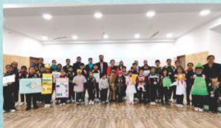
Little Noblites participated in "English Poem Recitation Competition"