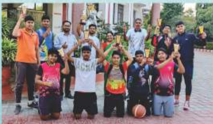
U-17 Basketball Team Won "Gold" in 65th SGFI Tournament