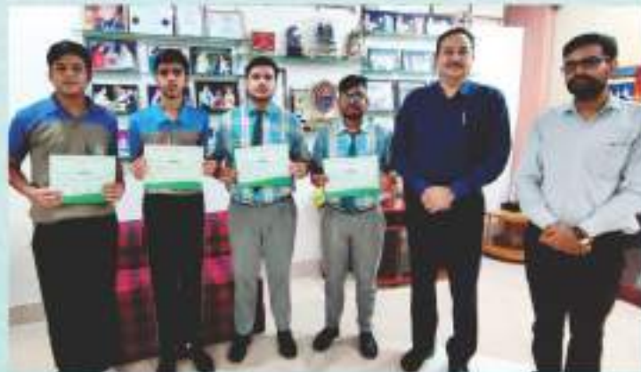
Scouts of NKPS won "Rajyapal Puraskar"