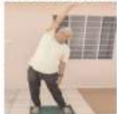
एनके पब्लिक स्कूल के विद्यार्थियों की योग प्रतियोगिता में भाग लेते हुए।

जयपुर। ईद मौक़ा रोड स्थित एनके पब्लिक स्कूल में 14 जून से 21 जून तक योग सप्ताह के आयोजन का आयोजन हो गया। योग प्रतियोगिता आयोजित की गई। योग प्रतियोगिता 7:00 से 7:30 के बीच का कार्यक्रम लोगों के बीच प्रसारित, व्यवसायिक और शैक्षणिक प्रतिस्पर्धा का था।